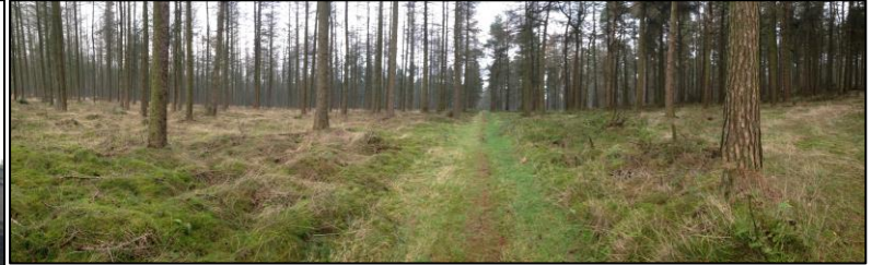
Rodley Nature Reserve (Bing, 2016)